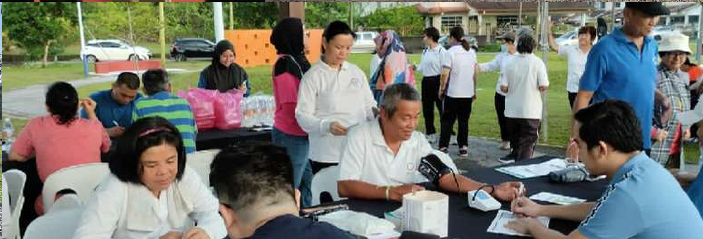
PROGRAM KOMUNITI KEKAL AKTIF DI USIA TUA "ELDERLY FRIENDLY PARK" - JUH KE TAMAN, KITA EXERCISE SIK KIRA USIA