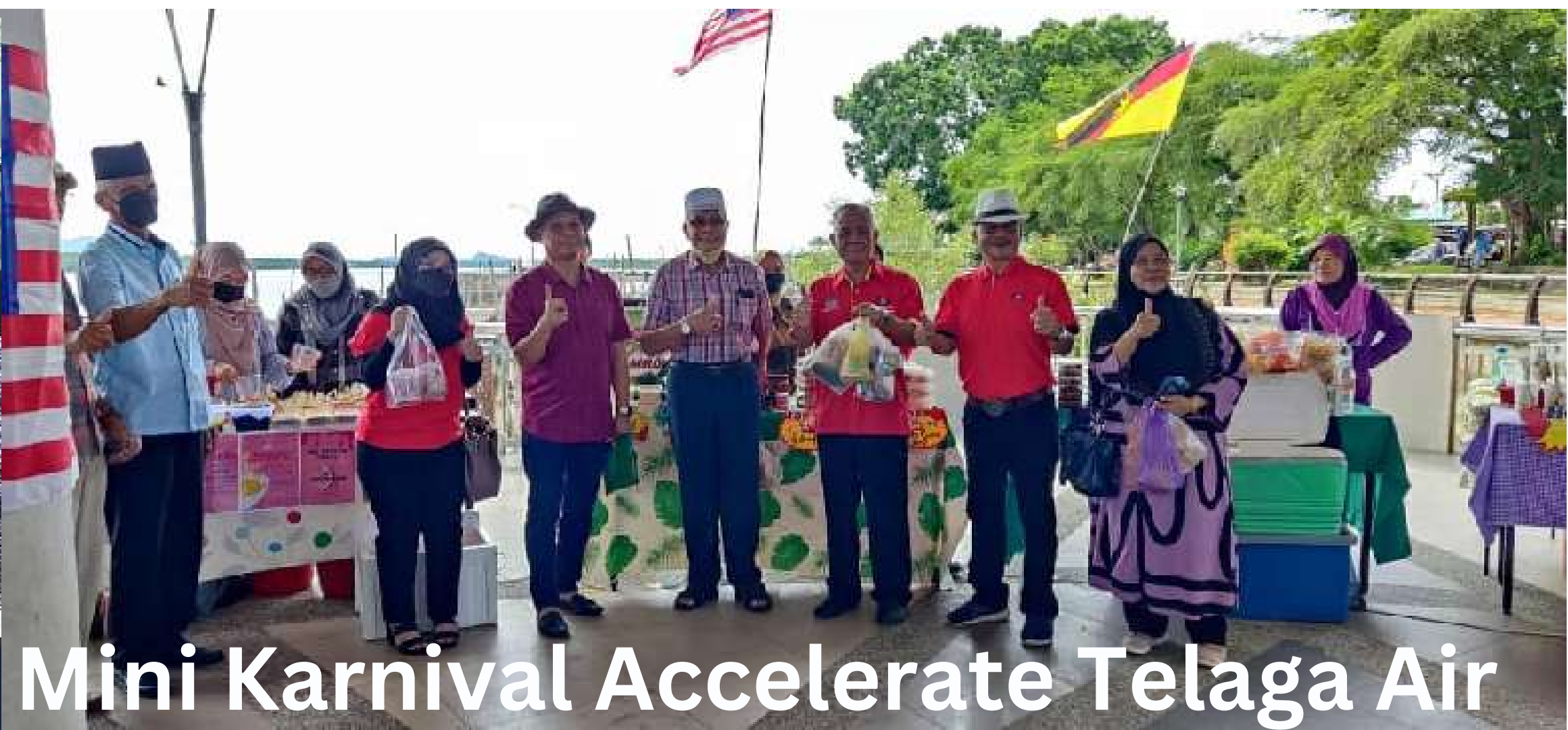
Mini Karnival Accelerate Telaga Air